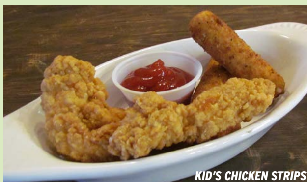
KID'S CHICKEN STRIPS

Breaded and fried chicken strips served with Mozzarella Sticks. 5.99