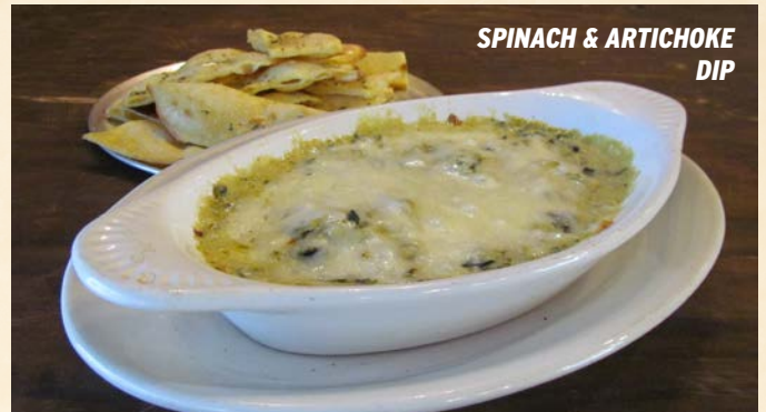
SPINACH & ARTICHOKE DIP